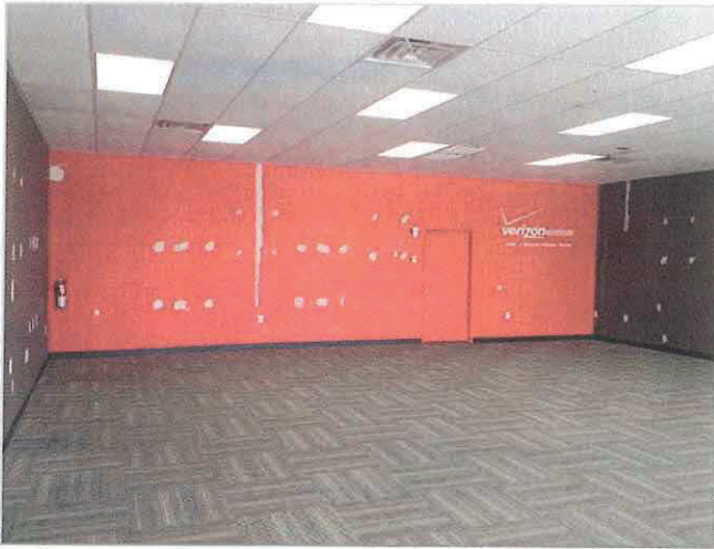
Wal-Mart Shadow Space