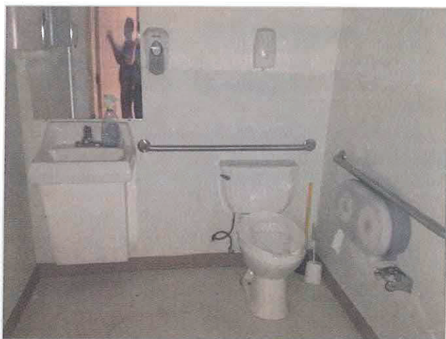
Wal-Mart Shadow Space