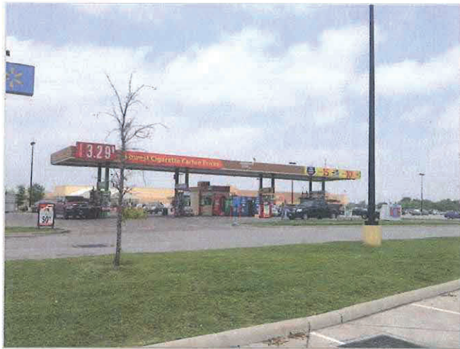
Wal-Mart Shadow Space