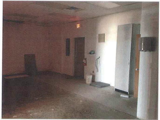
Wal-Mart Shadow Space