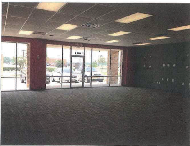
Wal-Mart Shadow Space