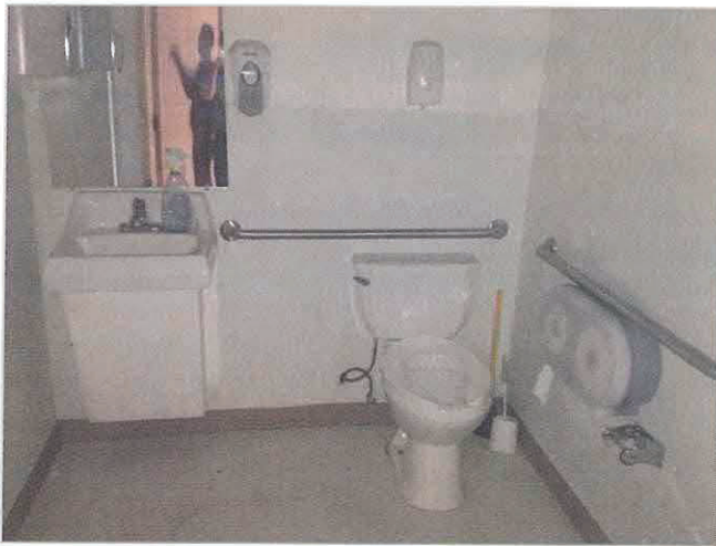
Wal-Mart Shadow Space