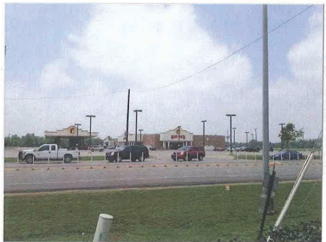
Wal-Mart Shadow Space